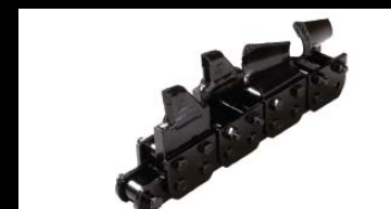
50/50 SHARK TOOTH CHAIN