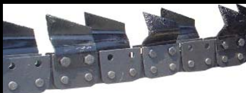
DOUBLE STANDARD CHAIN