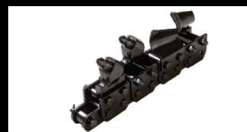
50/50 BULLET TOOTH CHAIN